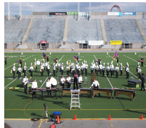
2008 AW Marching Unit

CALLING ALL MUSICIANS, DANCERS, PERFORMERS, KIDS WHO LIKE TO HAVE FUN, GET INVOLVED, HAVE LOTS OF FRIENDS!!!